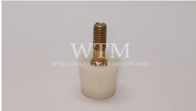
Plastic Cone B9 x 12mm