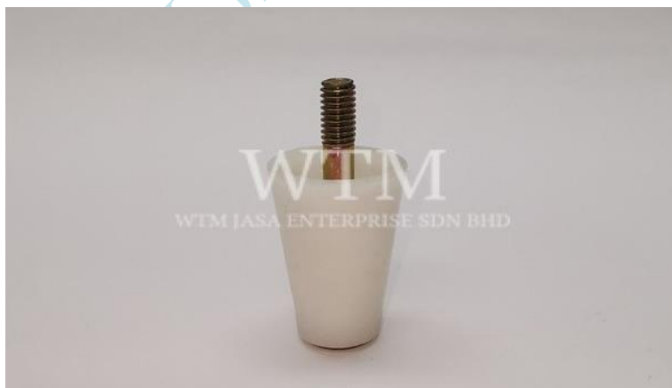
Plastic L50 cone